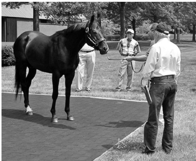
Conformation and Pedigree Clinic